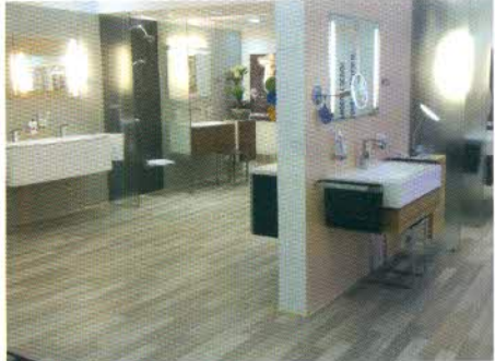
Keuco's first showroom in Northern India.