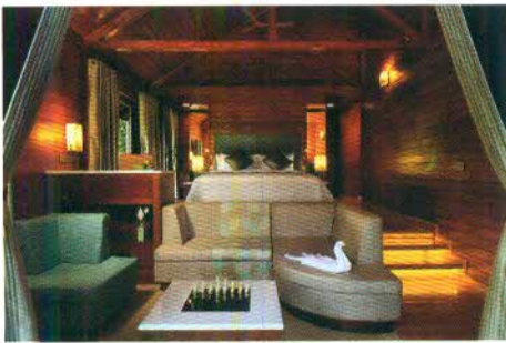
The cottages are embellished with tropical furnishings.

After a successful launch of Phase 1, The Tamara Coorg, a luxury resort, launched its second phase in April, taking leisure to the next level. Set amidst coffee plantations, it includes three distinct styles of cottages as suites and a spa complex. These cottages have contemporary tropical furnishings and offer the best views of the hillside in the resort. The spa introduces a wider offering in treatments and relaxation techniques, including aromatherapy, relaxing Swedish and sports massages, anti-stress back treatments, neck and shoulder massages, foot reflexology, skincare, and hand and foot care treatments. The spa also features a steam shower, along with water-jet and salt scrub treatments in the Jacuzzi. "This set of resorts will be preferred by people at any time of the year and will let them experience tranquillity and serenity like never before," stated Senthil Kumar, director and CEO at The Tamara Coorg.